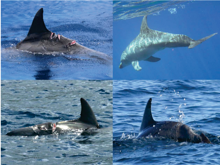
Figure 2. Representative photographs of shark-inflicted injuries on Indo-Pacific bottlenose dolphins ( T. aduncus ) from Réunion.

Injuries to dolphins were assessed from photographs taken during standard photo-identification surveys. We only included individuals in analyses if they were identified based on photo-identification. Therefore, a single individual could not be counted more than once. We considered an injury to be shark-inflicted if it was crescent shaped and/or contained deep and widely spaced tooth impressions that could only have been caused by a shark (Fig. 2). For all individuals included in the sample from all locations, photographs of each individual were available for the dorsal surface and upper flanks of the dolphin from the head to the peduncle on both sides. Therefore, the majority of shark bites on the upper body surfaces likely were recorded. Because previous studies of bottlenose dolphins ( Tursiops cf. aduncus ; Heithaus 2001b) and Atlantic spotted dolphins ( Stenella frontalis ; Melillo-Sweeting et al. 2014) suggest