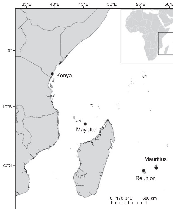
Figure 1. Location of study sites in the southwestern Indian Ocean.

Here, we estimated the proportion of individual Indo-Pacific bottlenose dolphins ( Tursiops aduncus ) bearing injuries inflicted by sharks at four locations in the southwestern Indian Ocean (southern Kenya, Réunion, Mauritius, and Mayotte; Fig. 1) during photo-identification surveys (see Kiszka et al. 2012, Webster et al. 2014 for details). In Kenya, the sampling focused on the Kisite-Mpunguti Marine Protected Area ( 4^{\circ}04'S , 39^{\circ}02'E ) and adjacent waters ( \sim 200 km 2 ), and was conducted from January 2006 to December 2009. Photo-identification surveys were conducted every month (except from January to June 2008 due to national political conflicts). This area mostly covers shallow waters (0–15 m), including coral reefs, where Indo-Pacific bottlenose dolphins are common (Pérez-Jorge et al. 2015). Mayotte ( 12^{\circ}50'S , 45^{\circ}10'E ) is located in the northeastern Mozambique Channel and is part of the Comoros archipelago (Fig. 1). The island is almost entirely surrounded by a 197 km barrier reef, forming the largest coral lagoon in the Indian Ocean and averages 20 m in depth (1,500 km 2 ). Adjacent to the northern part of the lagoon, there is a submerged reef bank ( Iris ) that is about 215 km 2 . Indo-Pacific bottlenose dolphins occur